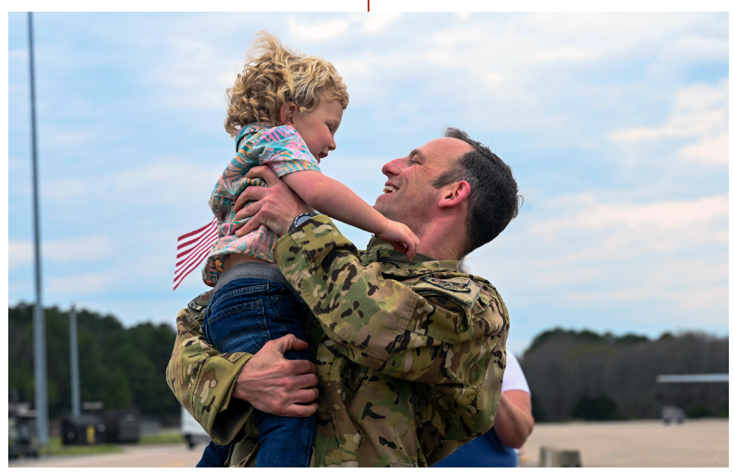
The appearance of U.S. Department of Defense (DoD) visual information does not imply or constitute DoD endorsement.

As a best practice set forth by the alliance, military installations now conduct needs assessments of TSMs and military spouses. The assessments help highlight the types of training, certifications, and licensures that TSMs and military spouses are seeking. Such assessments also identify gaps in services provided by the Texas workforce system.